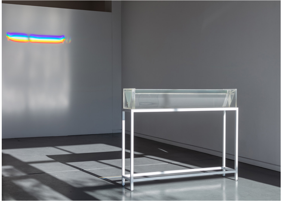
Charles Ross, Untitled (Beam) , 1968, acrylic, oil, adhesive, 48 x 8 x 9 inches

Each prism—an exquisitely modeled block of glass displayed on a white-metal plinth—offers itself as evidence of, and as a threshold into, a way of thinking: a mode of contemplation that is exceedingly elemental, nearly imperceptible. One could have stepped into Rule expecting nothing more than the dazzle of a previous generation's avant-gardism. Yet once I left the exhibition, I felt as though I had been given a primer on the world's most fundamental workings. As I watched the sun begin its daily descent through the gallery's windows, I saw white light get caught in the prisms, then be cast out as rainbows. Observing this, I was ushered helplessly into thoughts so basic, so rooted in the deep loam of the mind, they even brought me, the questioner, into question. What is water? What is light? What is time? And what surfaces, day after day and cloud cover depending, are a grammar-school lesson taught by pre-Socratic philosophers—Thales, Heraclitus, and