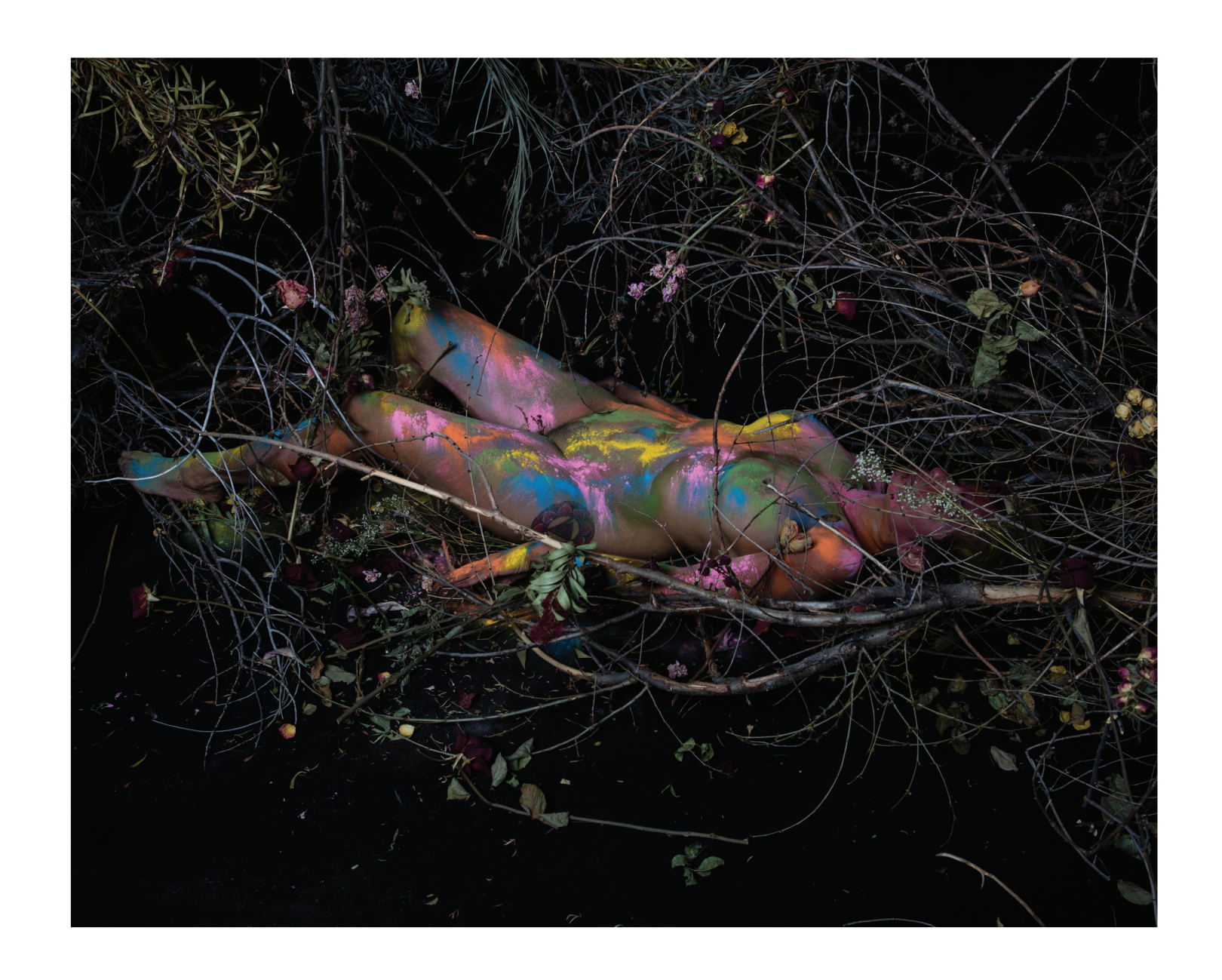
Renluka Maharaj, Sati's Sleep, 2015, pigmented ink print, 36 x 45, edition 1/1 AP (framed) Additional Prints Available