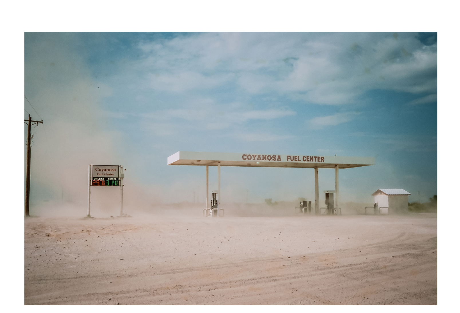
Rowdy Dugan, Coyanosa, TX, 2018, pigmented ink print, 30 \times 40 inches (framed) Additional Sizes Available