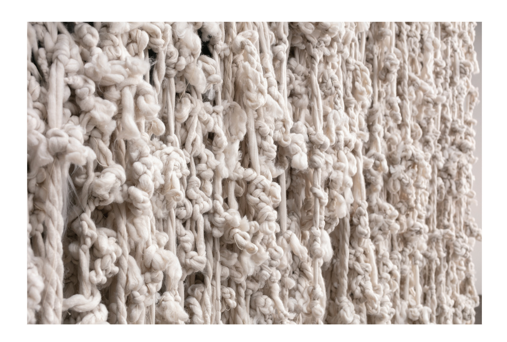
Erica Green, Moments Held, 2018, knotted fiber, site specific installation, 102 \times 100 \times 64 inches