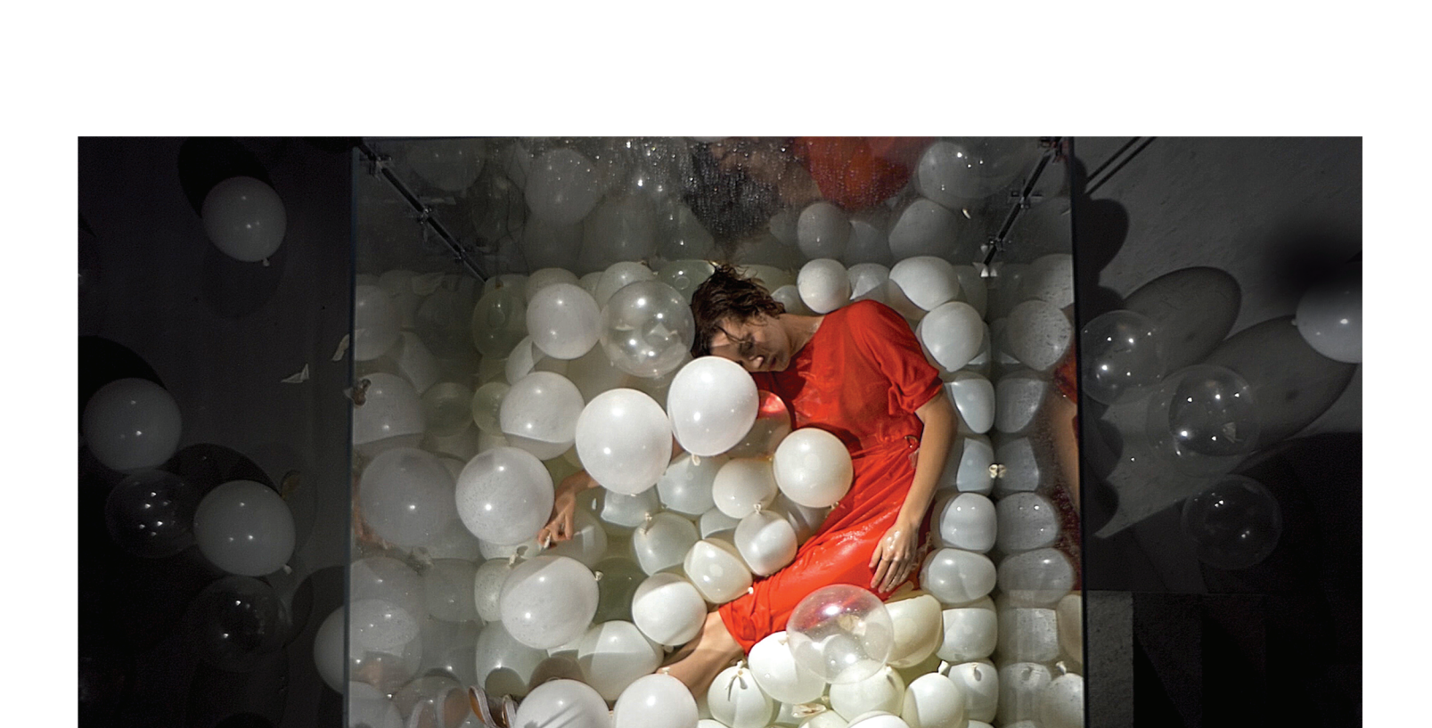
Shelby Rahe, On a Cloud, 2018, 5-Channel video, duration 30m 47s, edition of 5 Additional Prints Available