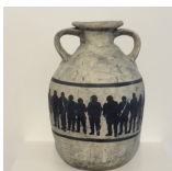
Police Line 2017, stoneware with glaze 10 x 8 x 8 inches