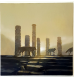
Nostos 2017, acrylic on canvas on panel, 24 x 24 inches