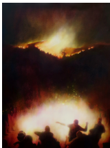
Fire with Fire 2017, acrylic on canvas 48 x 36 inches

01.01.1995, Waco, TX; 03.24.1997, San Diego, CA; 12.31.1999, Silicon Valley, CA; 11.29.2003, Tokyo, Japan; 05.21.2011, Alameda, CA; 10.21.2011, Alameda, CA; 12.21.2012, Tikal (Mayan Capitol); 08.23.2013, St. Petersburg; 11.09.2016 (2AM), Washington, DC