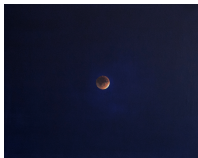
Moon Rust 2015, acrylic on canvas, 30 x 38 inches