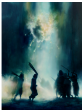
Falling Rocket 2016, acrylic on canvas 48 x 36 inches