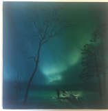
Icarus 2017, acrylic on canvas on panel, 24 x 24 inches