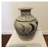
Eclipse 2017, stoneware with glaze 10 x 8 x 8 inches