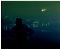
Nocture in Green and Gold 2017, acrylic on canvas on panel 16 x 20 inches

Denver + Marfa rulegallery.com info@rulegallery.com 303-800-6776