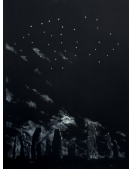
Stones and Drones III 2017, colored pencil on black Rives BFK 33 x 25 inches (framed)