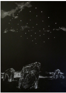
Stones and Drones II 2017, colored pencil on black Rives BFK 30 x 22 inches