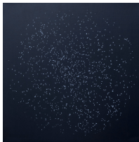
Series of SkyMaps 2017, acrylic and marble dust on canvas 12 x 12 inches