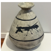
Drone 2017, stoneware with glaze 10 x 8 x 8 inches