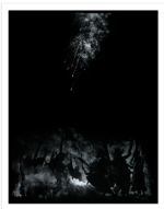
Falling Rocket (Space X) 2017, carbon pigment print on Hahnemühle paper, edition of 15 + 2 AP, 20 x 16 image / 22 x 18 inch paper