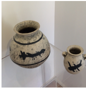
Three Drones & Hubble 2017, stoneware with glaze 10 x 8x8 inches & 6 x 5 x 5 inches