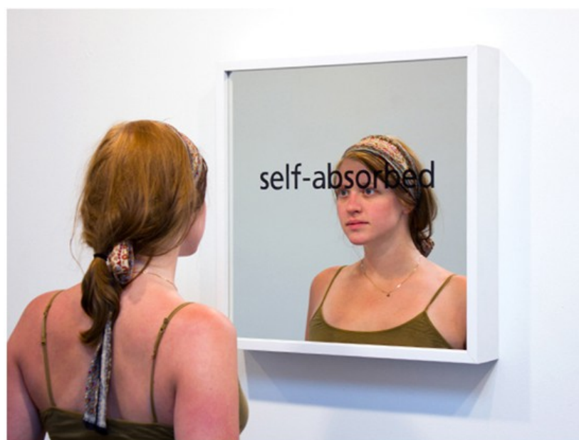
Joseph Coniff, Self-Absorbed , 2011, Glass Mirror, 20 x 20 inches

Coniff's show opens at the RULE Gallery on Friday, August 5 and runs through September 3. Friday's reception runs from 6-9 pm. For more information, go to www.rulegallery.com .